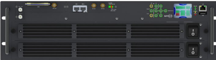
Maxiva™ UAXT/VAXT Ultra-Compact Front View (3RU)