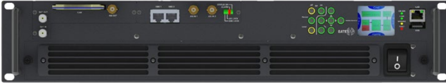
Maxiva™ UAXT/VAXT Ultra-Compact Front View (2RU)